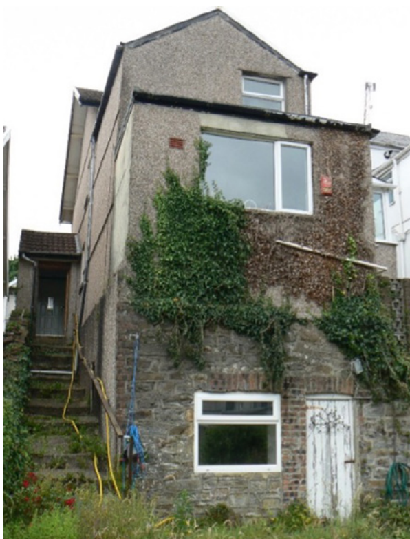
Figure 2: Category 1 falls on stairs

In Figure 2 below the home the accessway to the rear garden and garage is down a set of steep steps. These steps are in disrepair, slope dangerously and are slippery. The handrail is loose. To make matters worse, the rain-water drainage discharges directly onto the steps which means that they are always wet. Following a very cold night they would have ice on them. As this is a regularly used accessway this is deemed to be a Category 1 hazard to a vulnerable elderly person. If an elderly person was to have a fall on the steps the outcome would likely be severe. In the worst-case scenario, this could lead to paralysis requiring constant care.