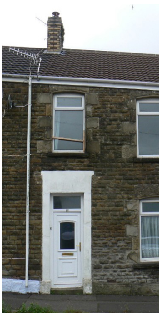
Figure 1: Case study example of the cost-benefits of housing improvement

This example shows the impact of poor housing on one household and some of the cost-benefits of improving the home.