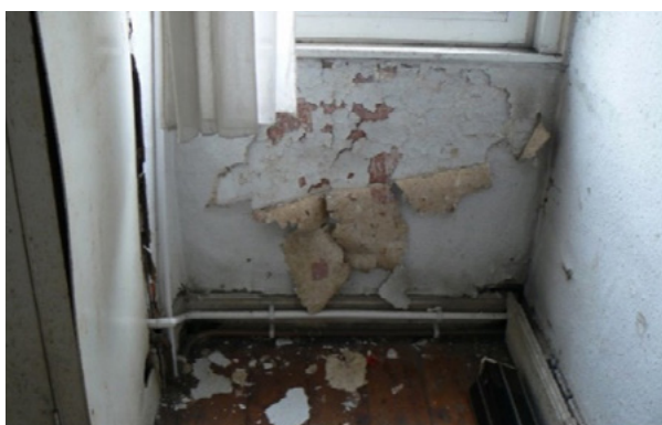
Figure 4: Category 1 dampness and mould growth

General disrepair can let in water. In Figure 4, a defective damp proof course and a broken downpipe are the sources of Category 1 dampness.