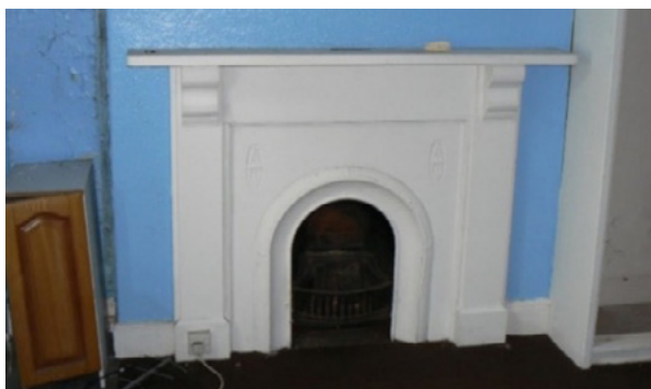
Figure 3: Category 1 excessive cold

Figure 3 is a typical of a rural home still burning solid fuel as their main source of heating. These fires are expensive to use, particularly when supplemented by electric heaters. Such 'cold homes' may have a severe impact on both physical and mental health if the household cannot afford the heating costs; the outcome could be respiratory or circulatory problems and, in extreme cases, hypothermia. People will not be able to live comfortably or perform tasks efficiently in a cold home, and they will be less likely to invite friends to visit.