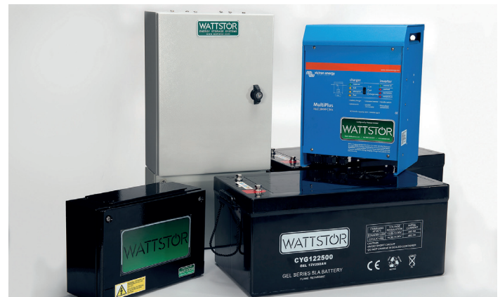
Examples of battery systems from Enphase and Wattstor (Lithium Ion and Lead acid based systems)

Batteries and battery systems can vary considerably in shape, size and weight. The greater the battery capacity, the greater the battery size and weight. Typical domestic systems vary from being the size of a small computer to the size of a washing machine.