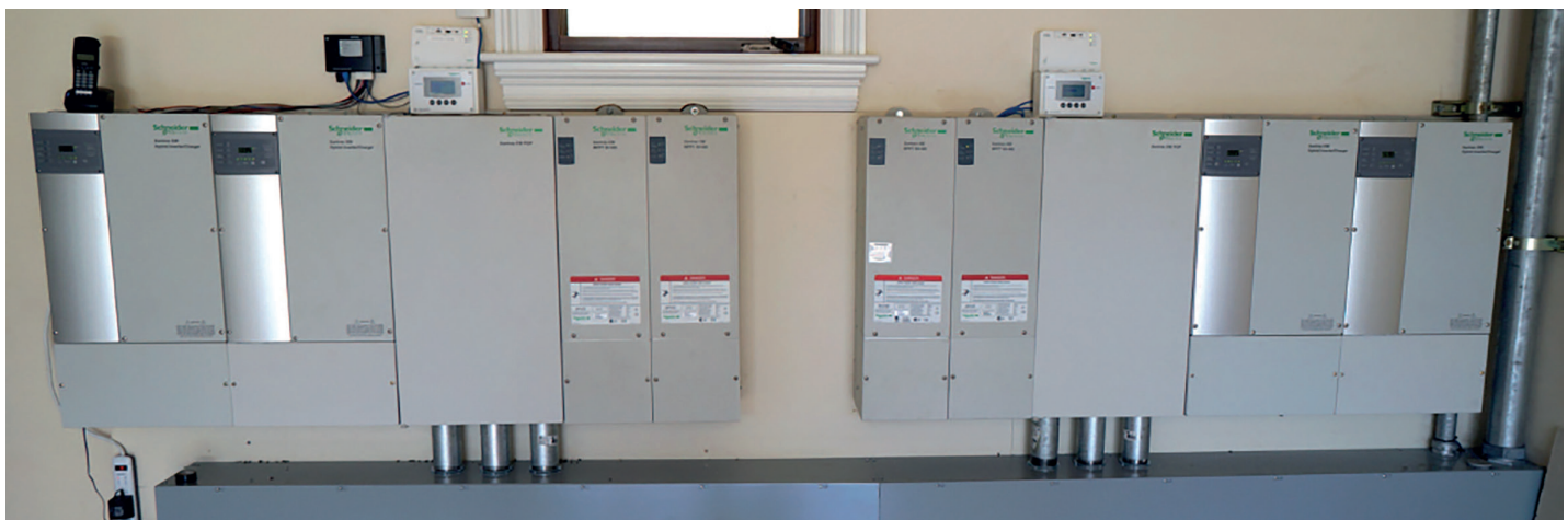
Image: Schneider Electric, a domestic installation for a large house or small commercial application

Cover images are from Fronius and Victron (image of domestic solar storage system at BRE Innovation Park at BRE, Garston, Watford, see www.ipark.bre.co.uk )